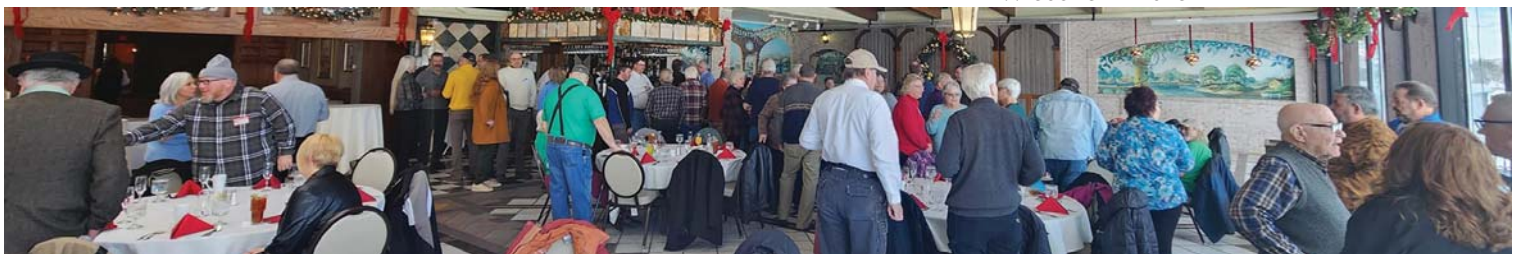
A record turnout at the Installation Brunch at the elegant Golden Mast Inn. Everyone enjoyed visiting prior to the Delicious Meal and Champaign.

May 11th — Wawbeek Spring Clean-up Day Easter Seals Camp Wawbeek, Wisconsin Dells