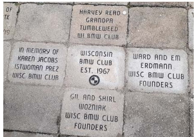
ABOVE: Our Club Bricks at the Memorial Park.

After the bricks were placed, refreshments were needed. The Door Devils said the clubhouse was open, and we were more than welcome to join them for a beverage. So most of us went and had a beer or soda with the fine volunteers that run this non-profit park. It's a very reverent site.