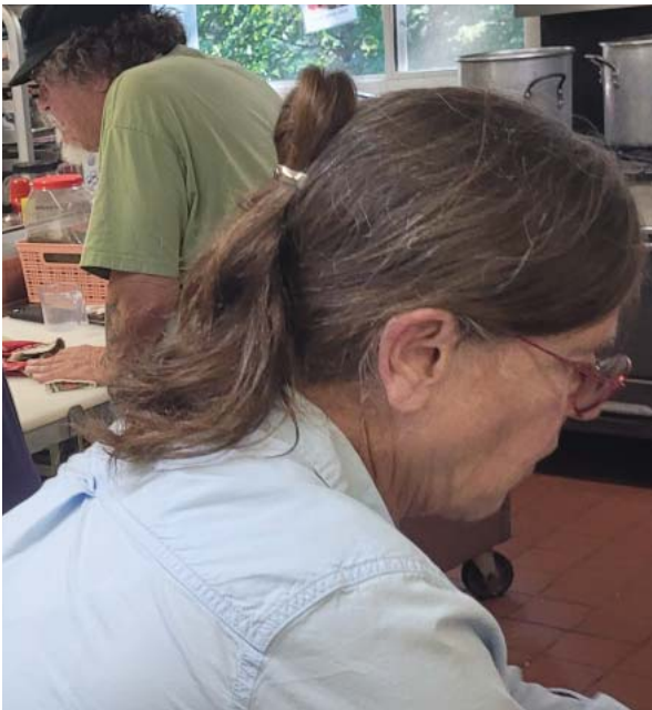
Many others participated in the weekend events. These are just a few. Thank you to ALL!!!