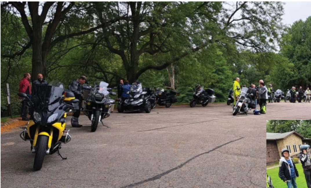
Above: Lake Redstone County Park, Photo by Kathy Waters