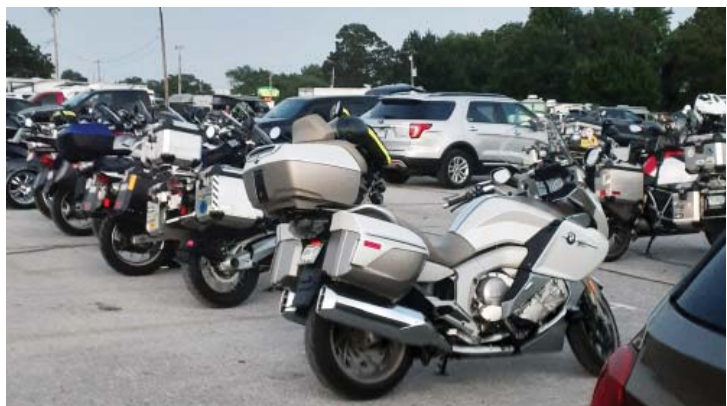
Photos from the MOA National

Thanks to all my club compatriots. You guys are alright.