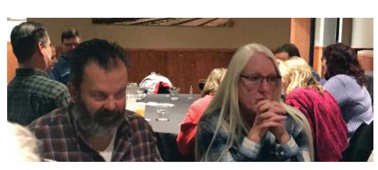
Special Thanks to Mona Rihn for submitting all these Installation dinner photos!!!