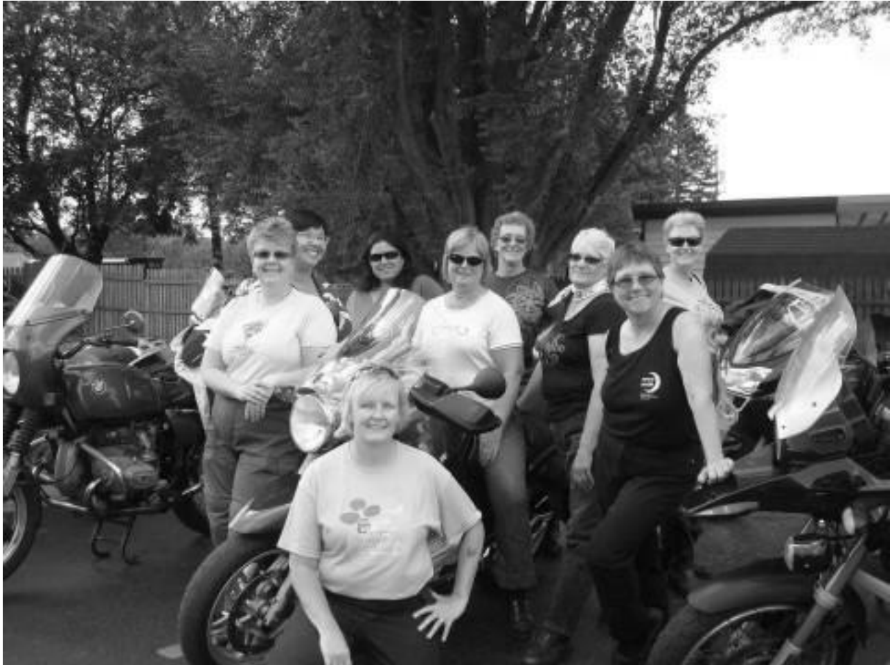
Women of Mayhem