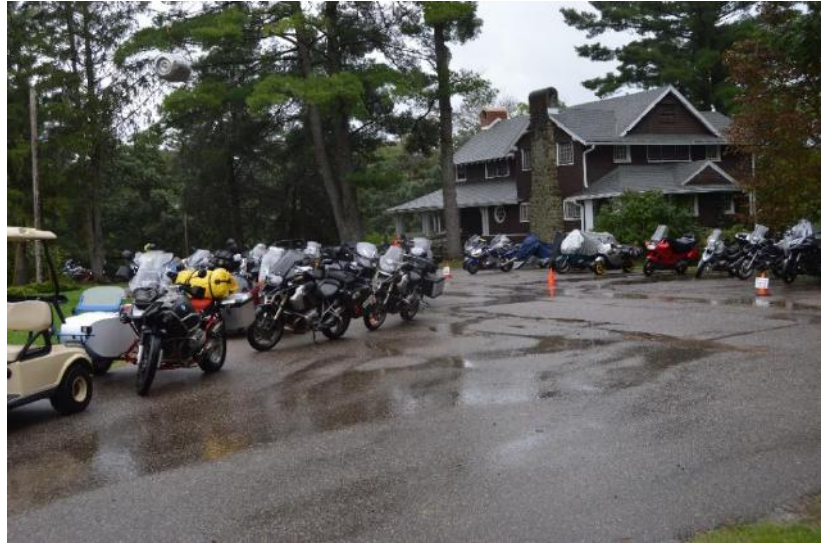
Various Dells Rally's