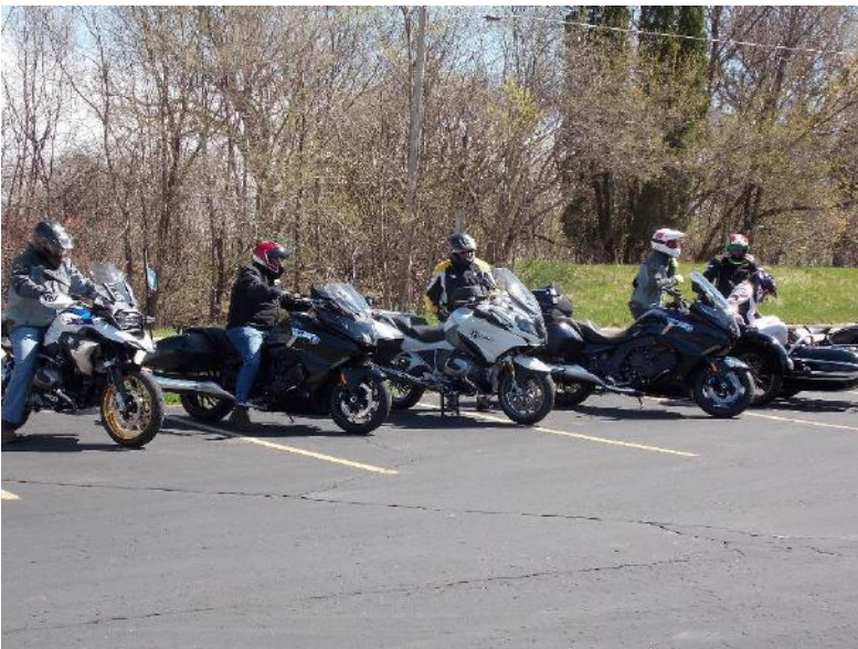
Art Mischler and some BMW riders